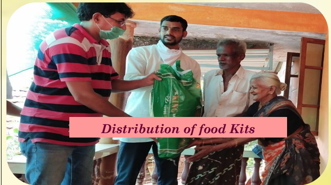
Distribution of food Kits

Many families of Kannada medium students in the St Aloysius High School and Primary School and even families of other poorer students benefited from this move. In co-ordination with Mangaluru City Corporation and the Labour Department, the College helped poor families of